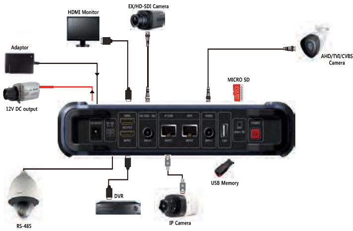
Diagramma di connessione